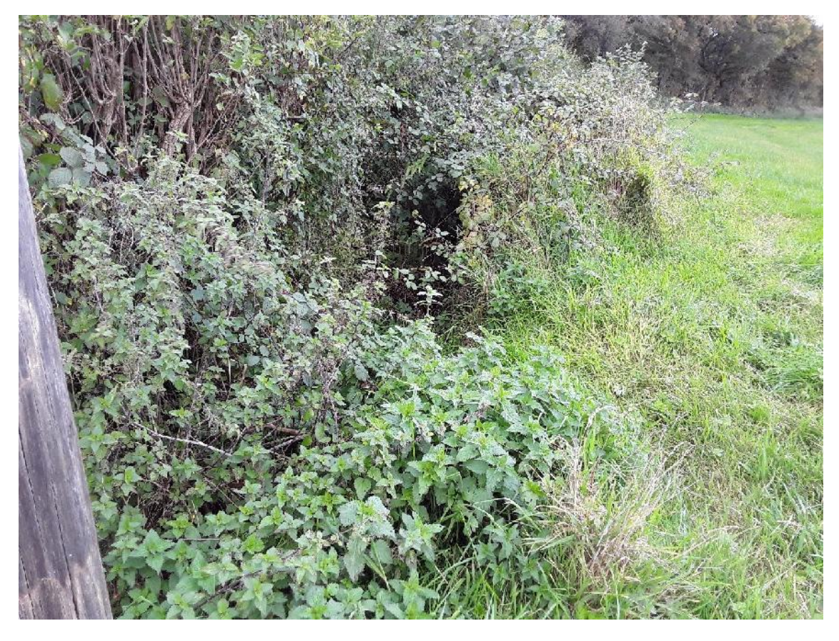
Photo 24: Standing water in field drain along northeast boundary of field 15

Photo 23: Field drain between fields 15 and 16