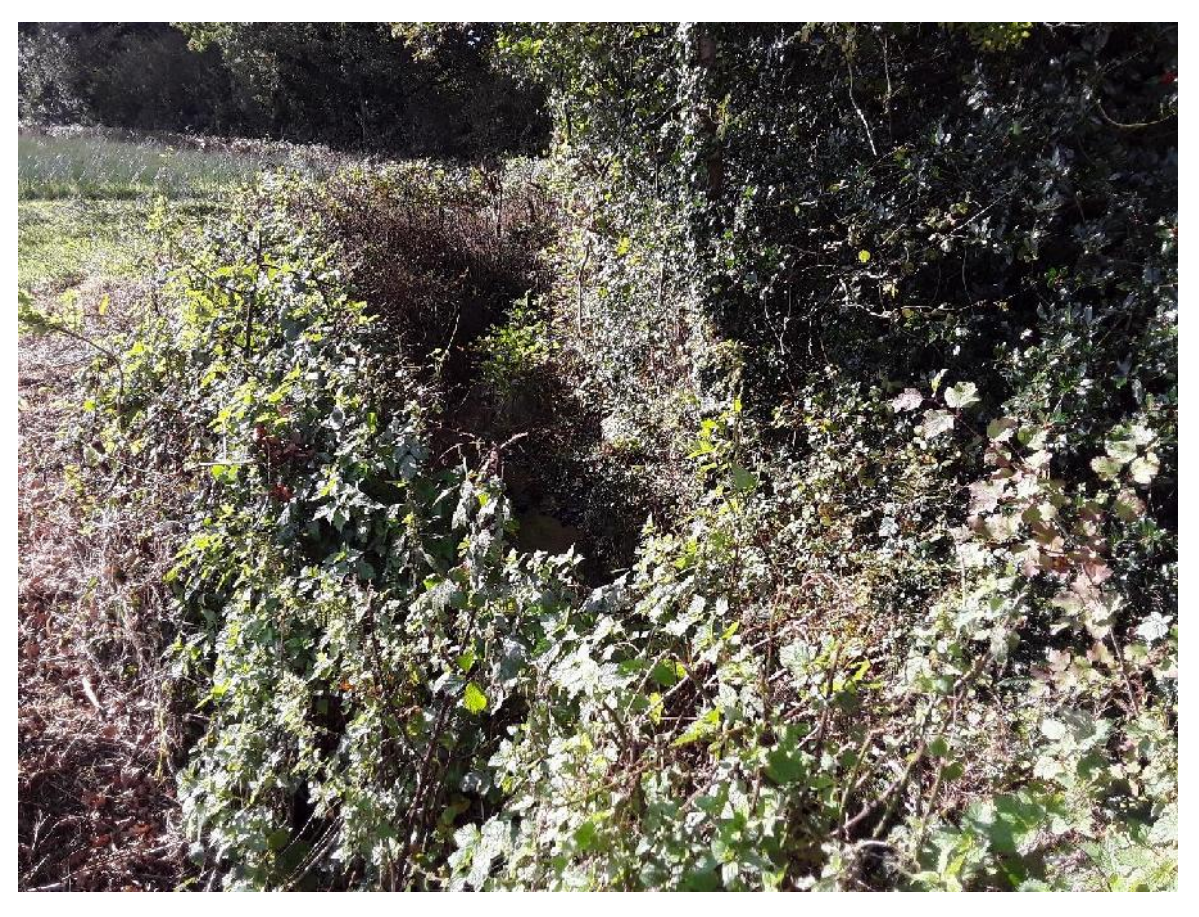
Photo 3: Watercourse along northern boundary of field 12, c.2.5m deep and 4m wide with runnning water.

Photo 4: Ditch located along the border of fields 11 and 12