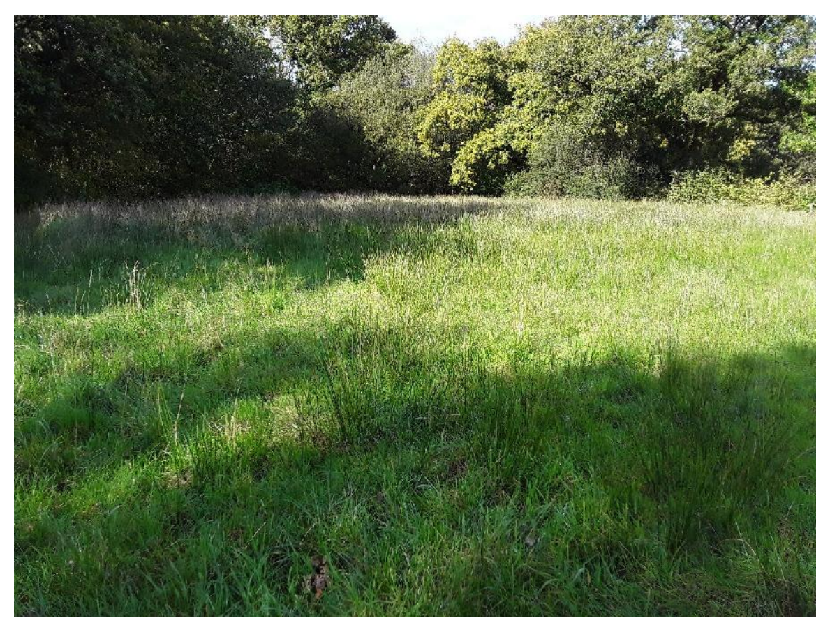
Photo 5: northern section of field 11 which suffers from waterlogging (area avoided)