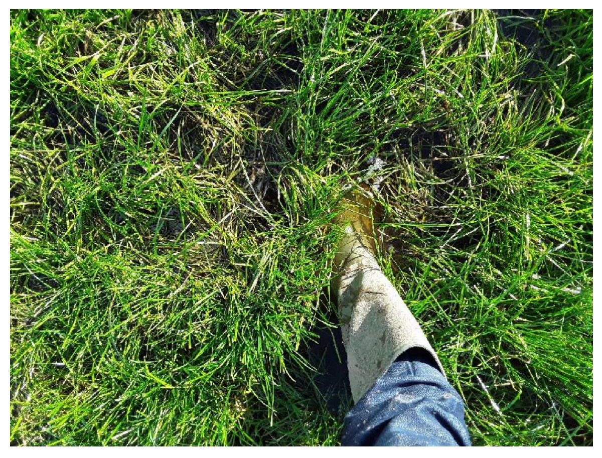
Photo 8: Drain that runs along northern boundary of field 4, c. 2m wide and 3m deep.