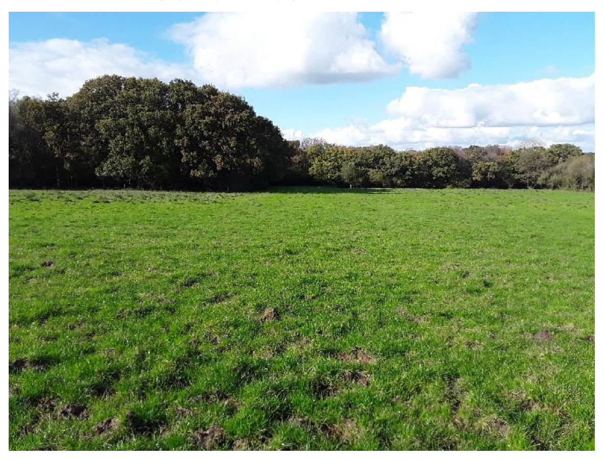
Photo 6: Field 10 is slightly marshy, however lying water was minimal

Photo 5: northern section of field 11 which suffers from waterlogging (area avoided)