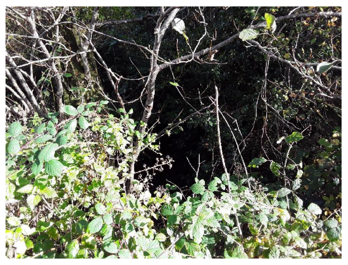
Photo 15: Watercourse between fields 25 and 27, c. 4m deep and 10m wide. Potential flooding as low point.

Photo 16: Low part of field 25 which is marshy (area avoided)